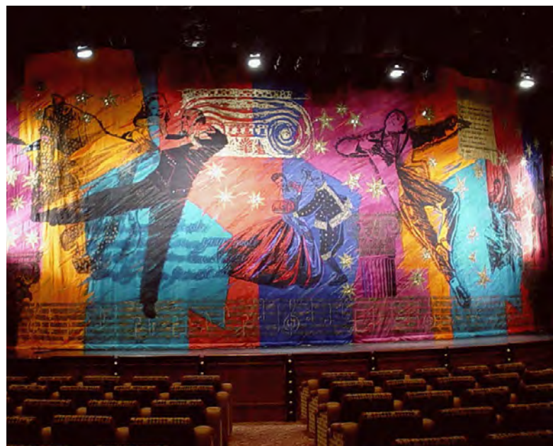
5 March 2026 Wendy Dolan

Embroidery Gallery: Sew Dainty - Discover Bucks