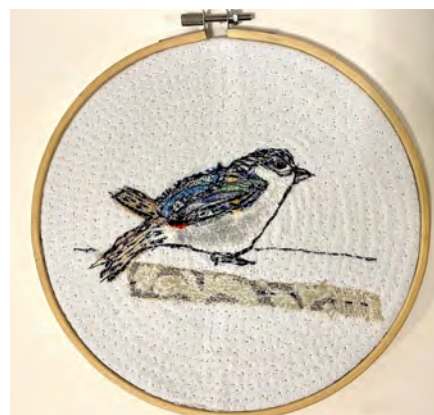
Anne Kelly: Collage Bird