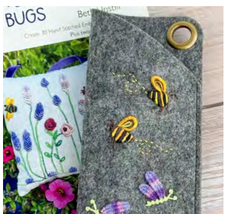
Beth Upstill: Embroidered Bugs