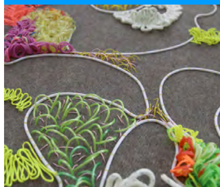
Elnaz Yazdani: Experimental Embroidered Worlds